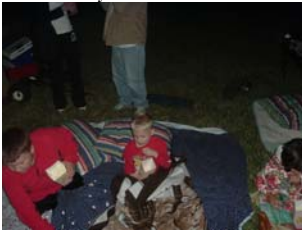
Young and old alike enjoyed the movie Peter Pan