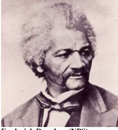
Frederick Douglass

sale earmarked for the endowment of a John Brown Professorship at Storer College.