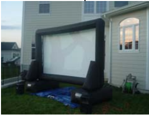
Screen is ready!!