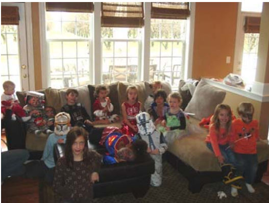
Kids enjoy Halloween Event at 61 Pathfinder!